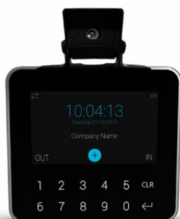
Example of MITO-03 installed on X3 terminal