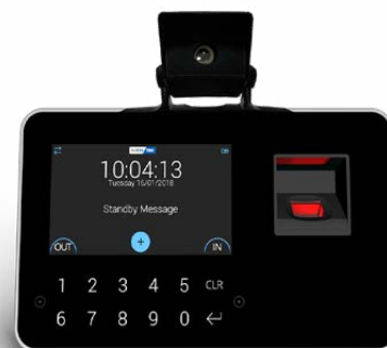
Example of MITO-03 installed on X3 BIO terminal