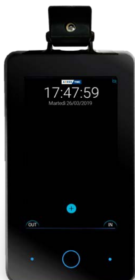
Example of MITO-03 installed on X7 GLASS terminal